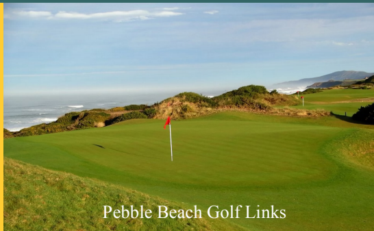
Pebble Beach Golf Links

Win – California's Monterey Peninsula has long been the destination of luxury-minded travelers around the world. Enjoy 3-nights deluxe accommodations for 2 at the 5-star "The Inn at Spanish Bay."