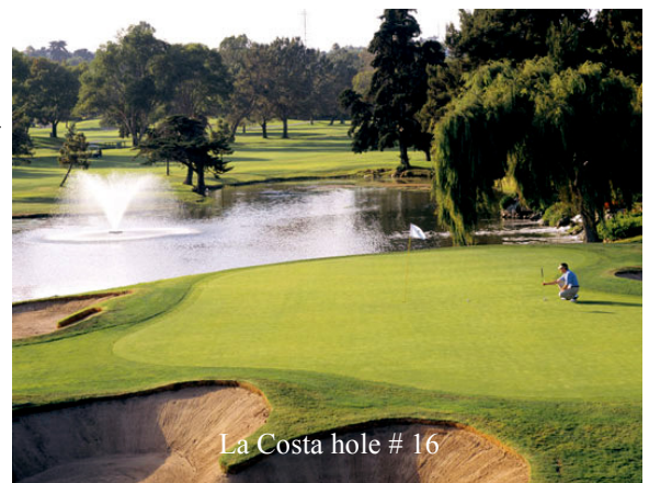
La Costa hole # 16

Each guest can choose between 1 round of golf at the championship North or South course, or 1 spa treatment at the luxurious Spa at La Costa. A mid-sized rental car is included. ($1,829, $2,547 w/air)